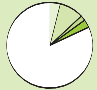
Investments by type**

The Conseco insurance companies have $9.7 billion of investments under management. In our portfolios, 93% of our bonds are investment grade. Our portfolios are well diversified—drawing from more than 60 sectors. They are also flexible—with 73% of bonds available to be liquidated within one week, if needed to meet policyholder claims.